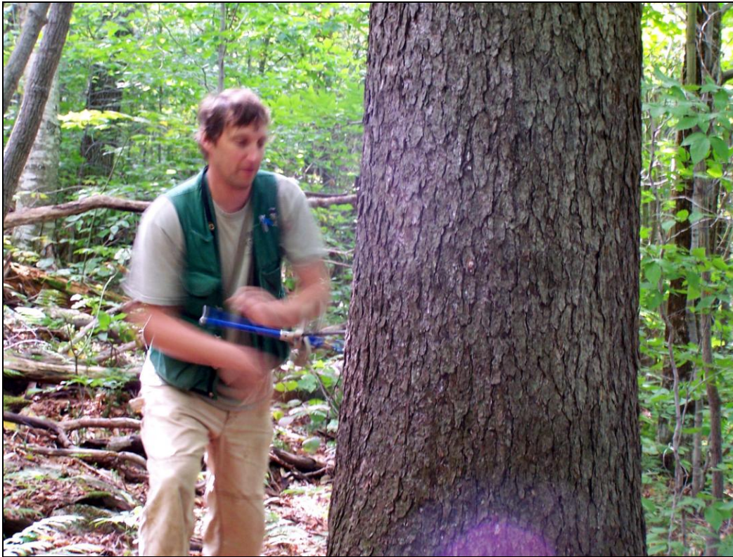
coring a red spruce