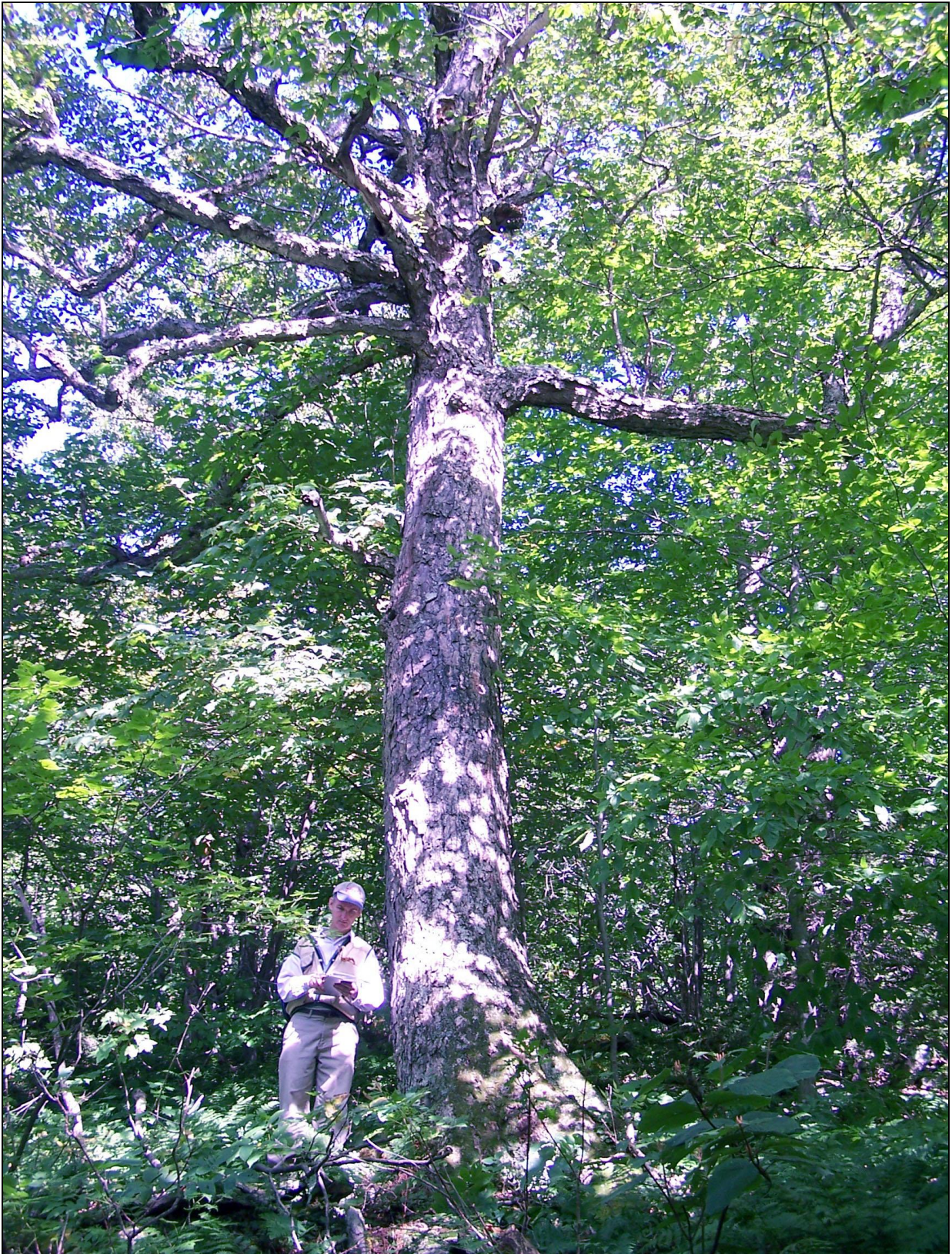
“stag-headed” yellow birch