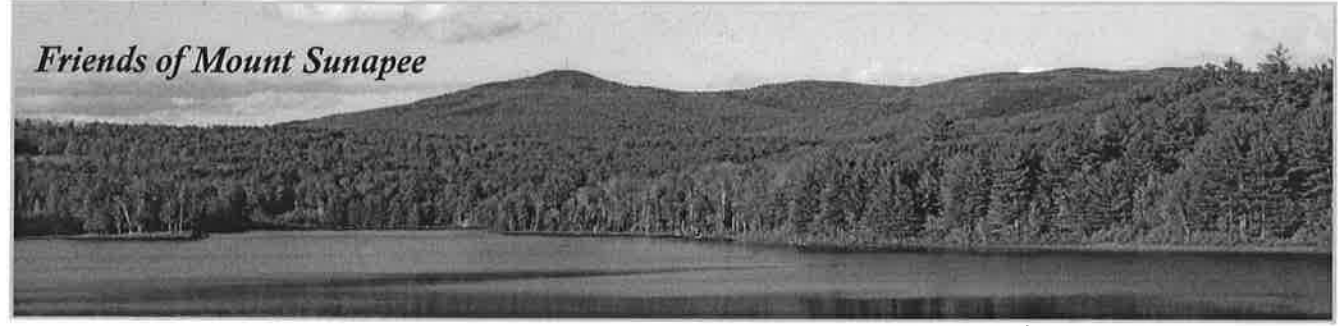
Mount Sunapee from Gunnison Lake, Goshen, N.H.