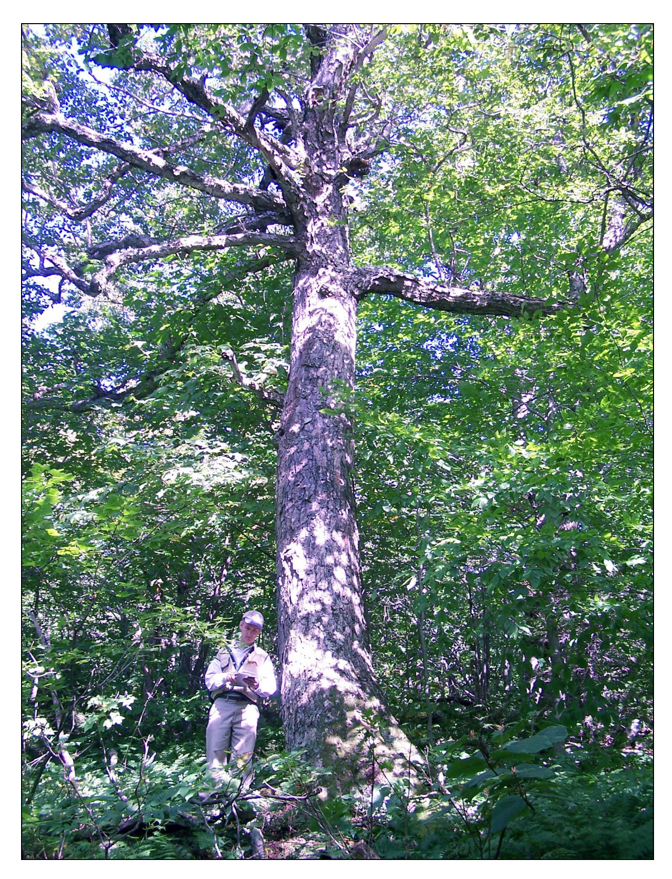
"stag-headed" yellow birch