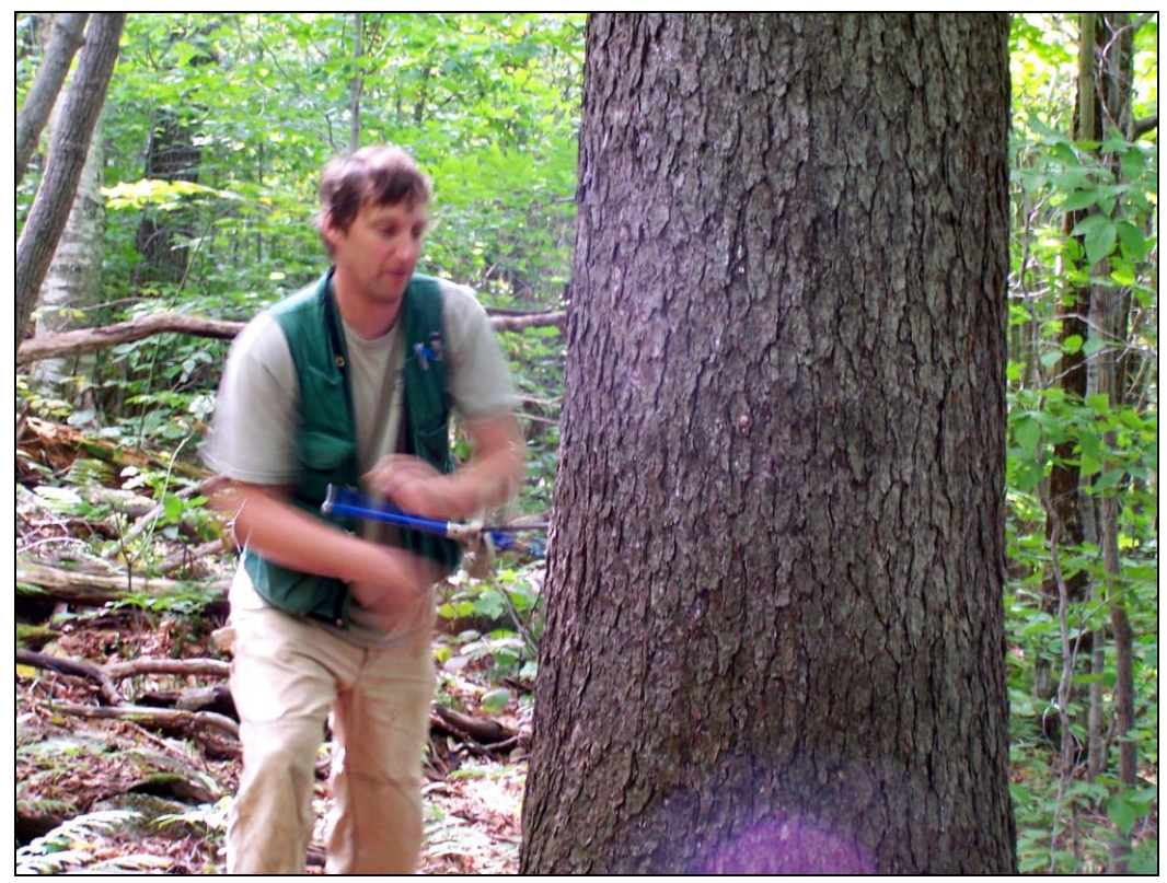
coring a red spruce